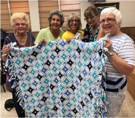
MEMBERS SPENT TIME TOGETHER MAKING BLANKETS FOR OPERATION SMILE CHILDREN